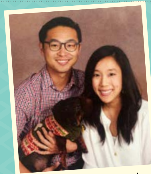
The Whang Family